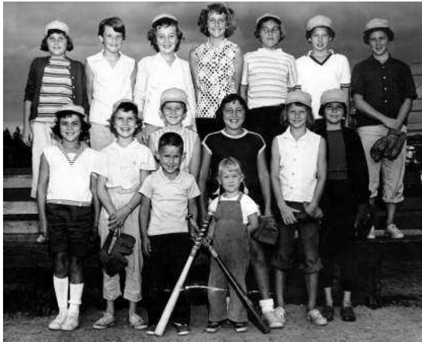
1958 Fillies Softball League Team