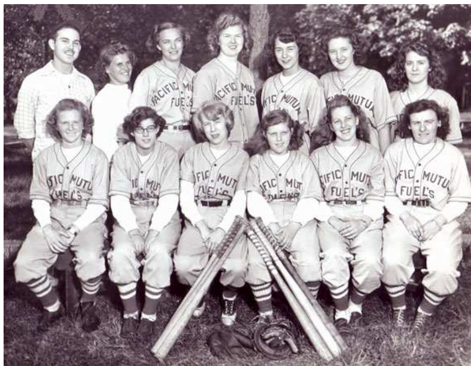
Pacific Mutual Fuel Women's Fastpitch Team, AKA Tacoma Fuelerettes, 1948