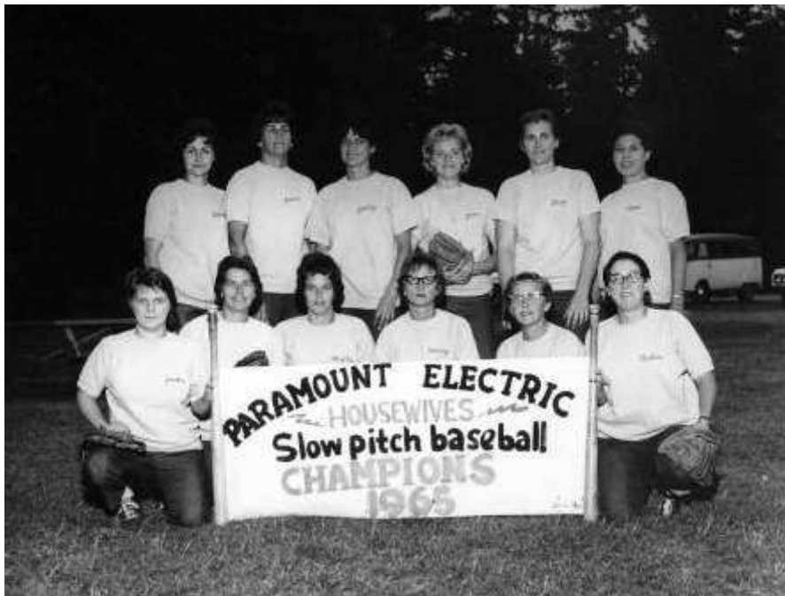
Ashamed to call it Softball?? This group was called the Paramount Electric Housewives and won the 1965 slow pitch championship